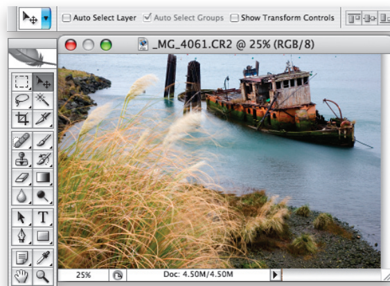
The quick and easy fix for this example where the menu bar isn't visible is to press F three times.

These problems might sound obscure, but I'm always amazed at how often I get requests for help with these particular oddities. ■